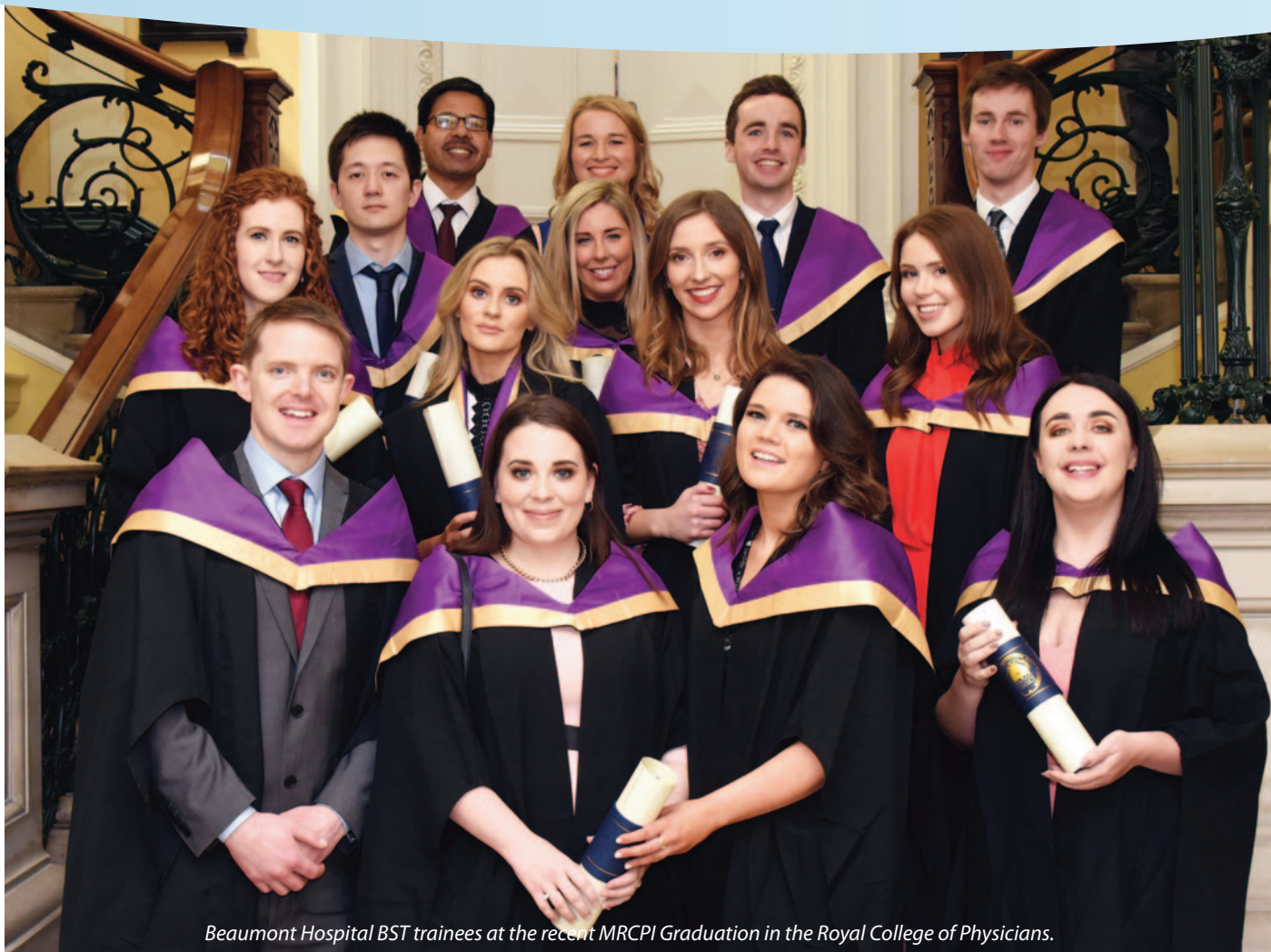
Beaumont Hospital BST trainees at the recent MRCPI Graduation in the Royal College of Physicians.