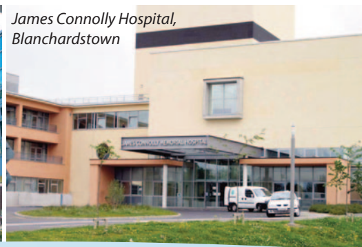
James Connolly Hospital, Blanchardstown