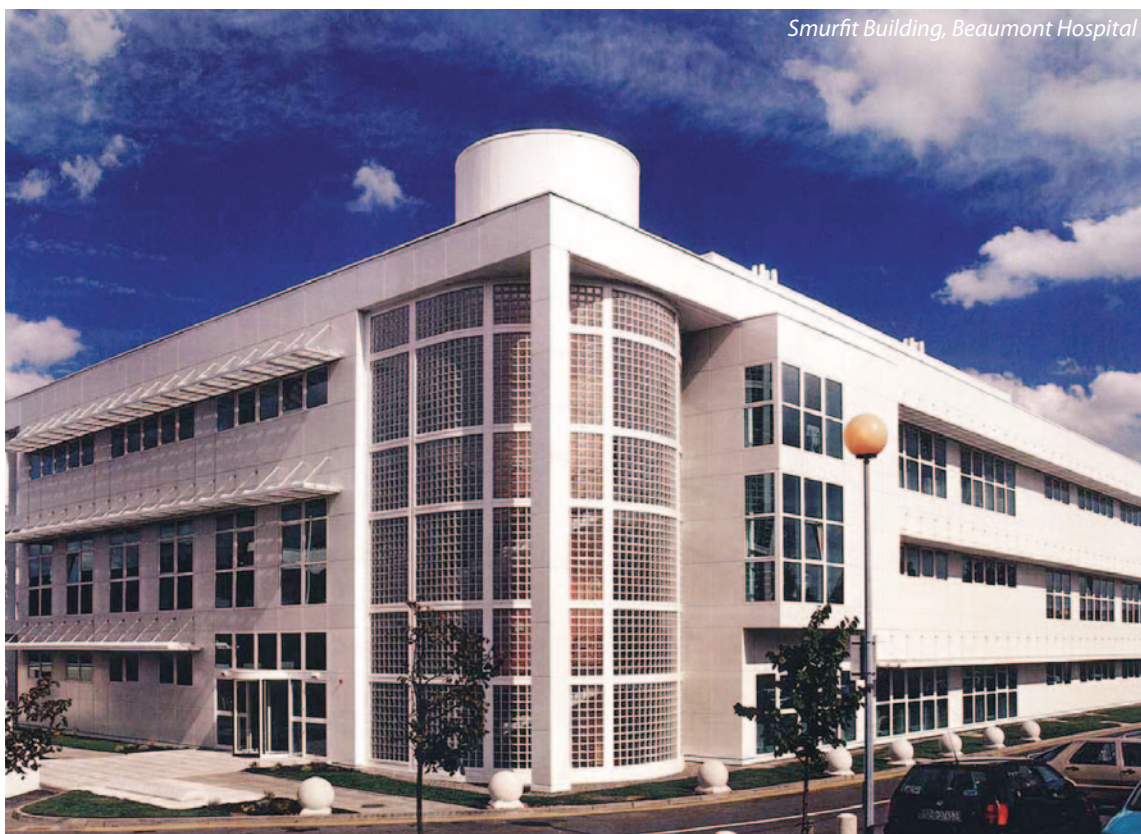
Smurfit Building, Beaumont Hospital