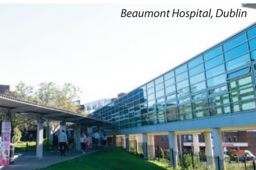
Beaumont Hospital, Dublin